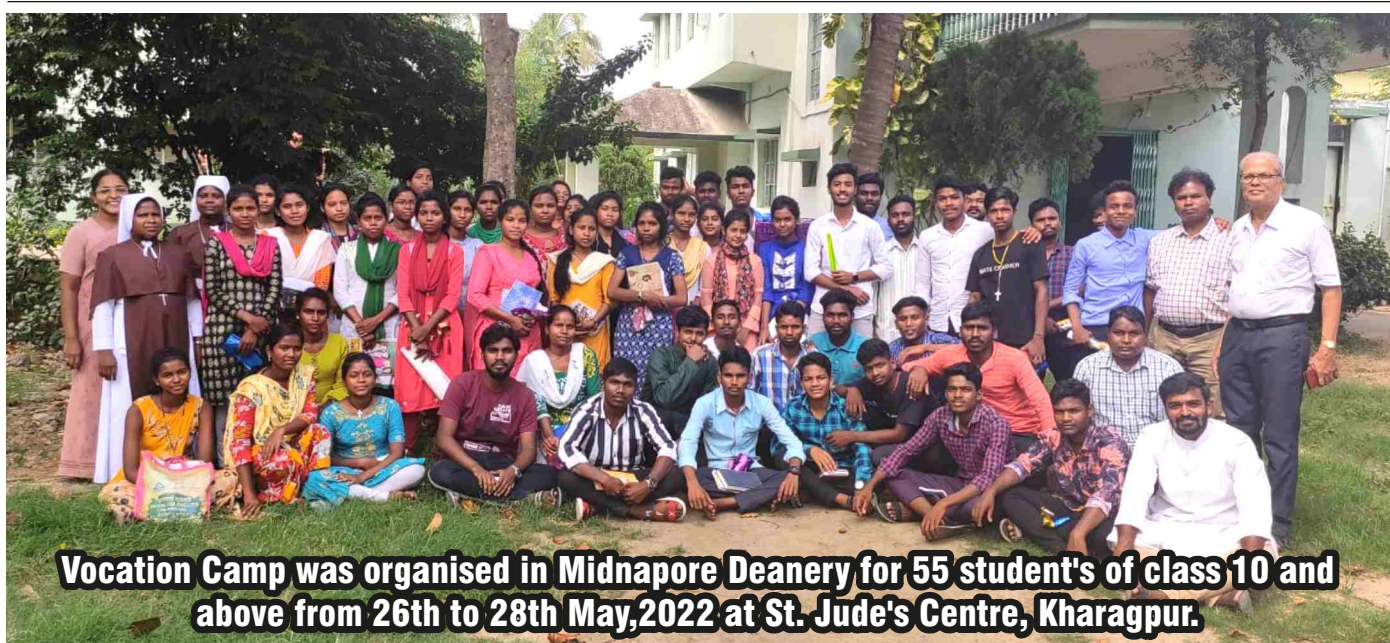
Vocation Camp was organised in Midnapore Deanery for 55 student's of class 10 and above from 26th to 28th May,2022 at St. Jude's Centre, Kharagpur.