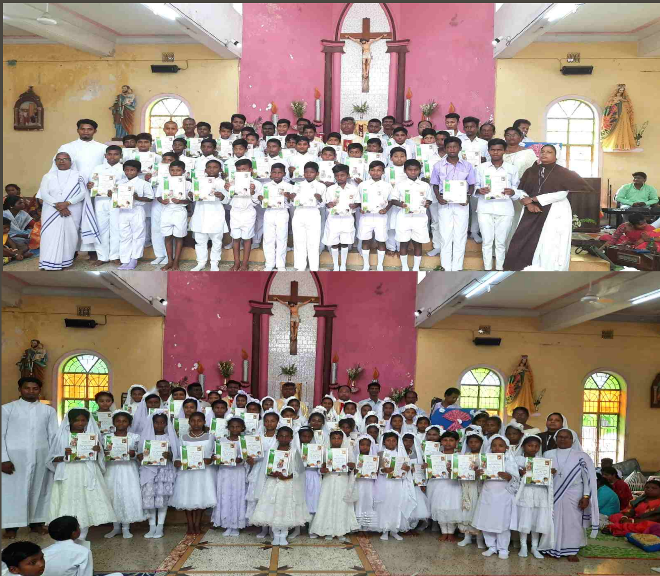
87 children received First Holy Communion in St. Paul's Church, Kamarchowki